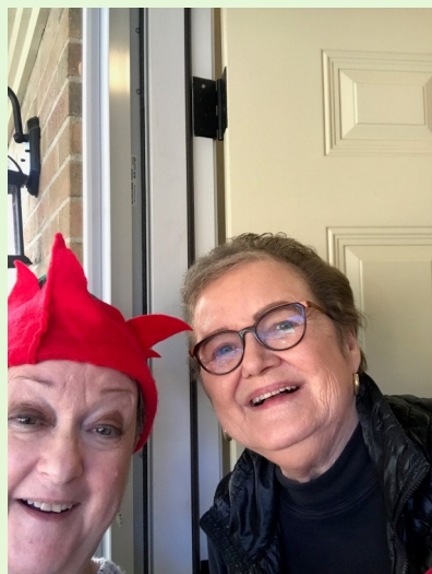
Pastoral Care Poinsettia Delivery