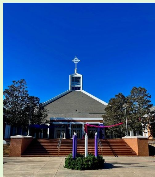
Welcome to Second Advent Wreath and Swags