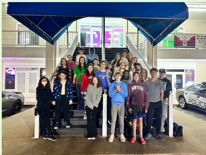
Second Presbyterian Youth (SPY) Lock In