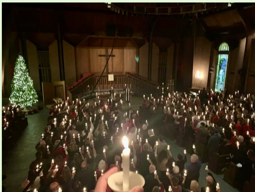
Sharing the Light of Christ