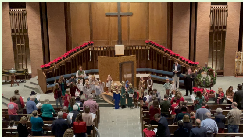
3:30 P.M. Children and Families Christmas Eve Service