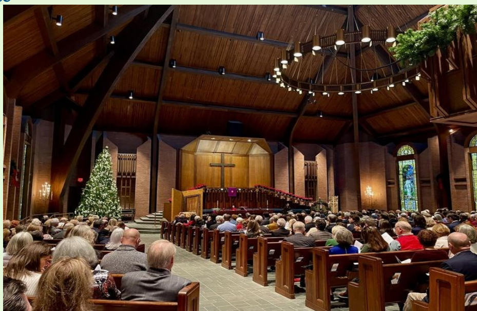
5:30 P.M. Traditional Christmas Eve Service